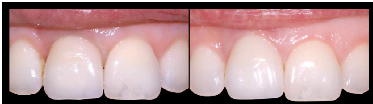
Fig.1: 28 years old female patient with one implant-supported crown in position n.11 (left) and 5 years later (right)